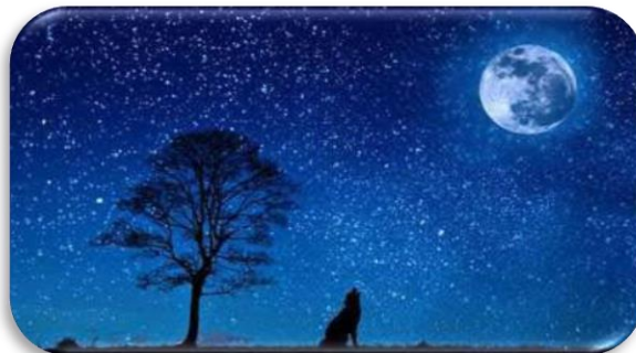
Star gazing party with Bernie Reim