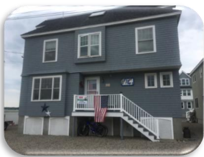
3 nights at Wells Beach, given by Gray Hirshfield

Here is a few of the items available for bidding: