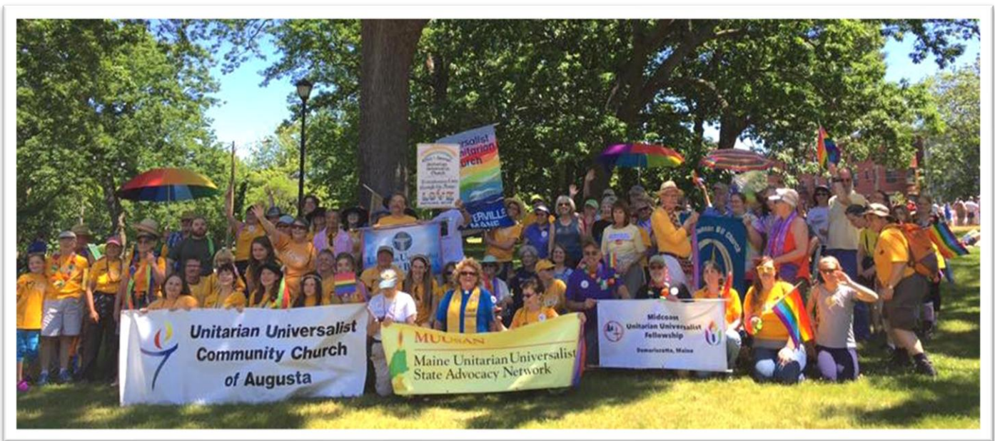
Pride Parade of MUSSAN members

MUUSAN (Maine Unitarian Universalist State Advocacy Network) is the only UU organization that unites all the UU congregations in Maine. This year there is a new structure that asks: "What matters to you?" regarding social and environmental justice in the legislature. Connection happens through a Congregational Legislative Liaison. That could be you, as FPUU does not have a liaison.