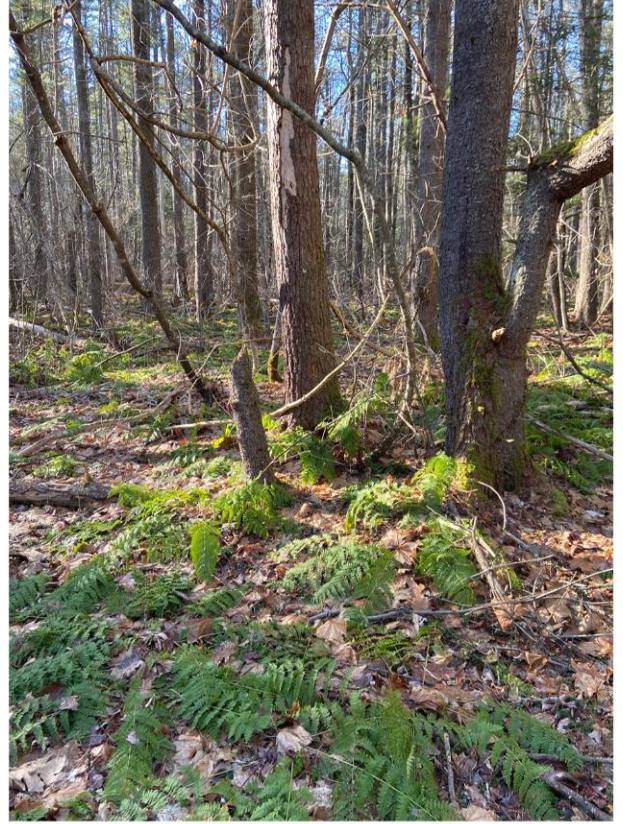
Evergreen Ferns at Wonderbrook Park